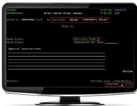
Customer Selection in Synon