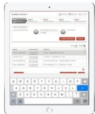
Customer Selection in iPad