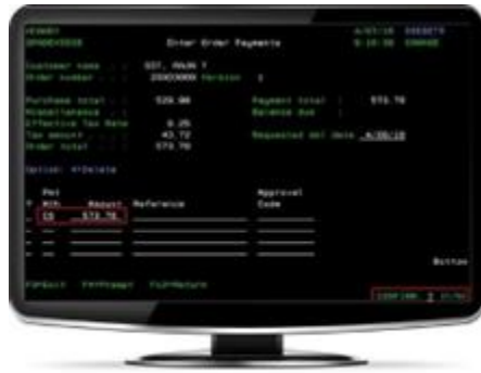
Payment selection and order completion