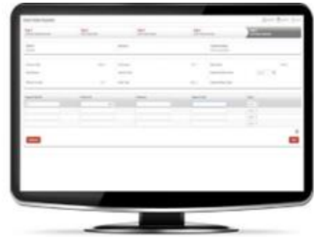
Payment selection and order completion

To know more about our IT services and solutions: